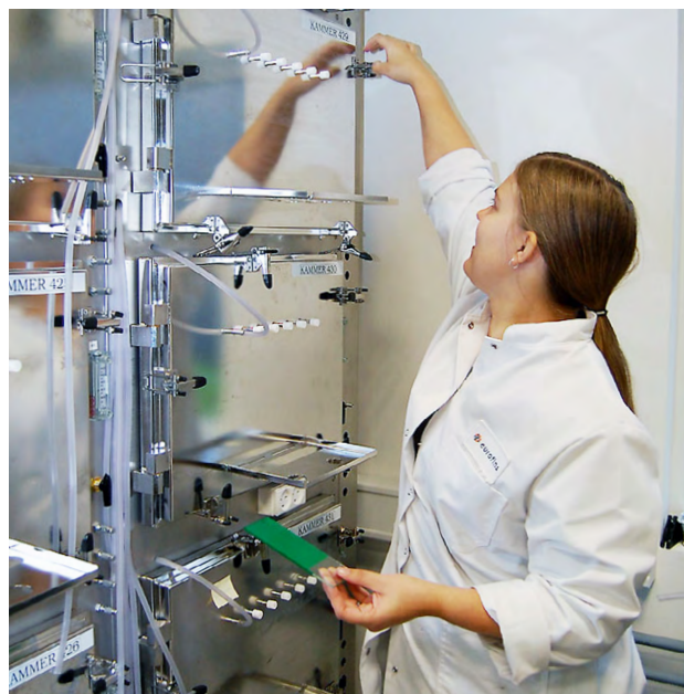
Eurofins Product Testing A/S

The company that commissioned the test is responsible for the respective test result. A list of laboratories that achieved reliable results in the round robin tests initiated by the GEV can be found on www.emicode.com/en/laboratories .